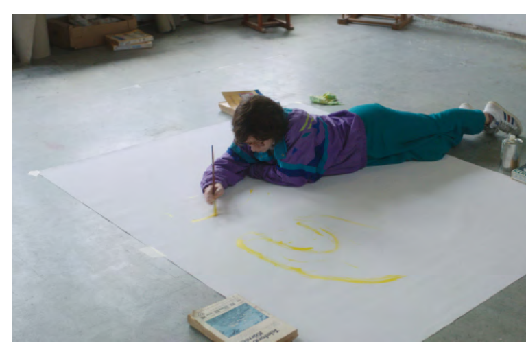
SLEEPING WITH A TIGER